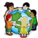
Caulder Lamm Alliance for Children