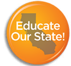
Educate Our State