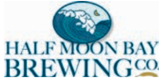
Half Moon Bay Brewing Company