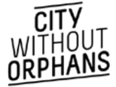
City Without Orphans