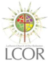
Lutheran Church of Our Redeemer