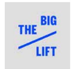
The Big Lift