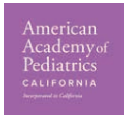
American Academy of Pediatrics, California