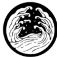
Asian Health Services