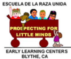
Escuela de la Raza Unida