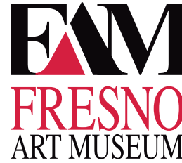
Fresno Art Museum