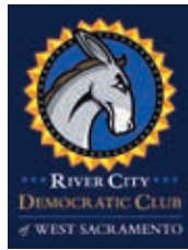
River City Democratic Club West Sacramento