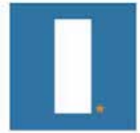
The Steinberg Institute