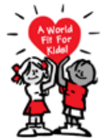
A World Fit For Kids!