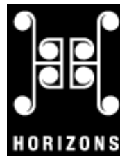
Horizons Unlimited of San Francisco