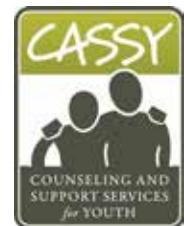
Counseling and Support Services for Youth