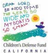
Children's Defense Fund - California