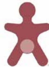
Genital Autonomy America