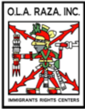
Organization for the Legal Advancement of RAZA