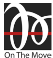
On The Move