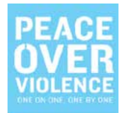
Peace Over Violence